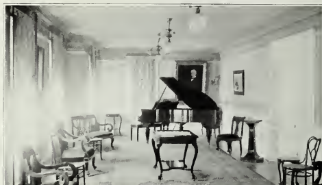
HEPBURN HALL PARLOR